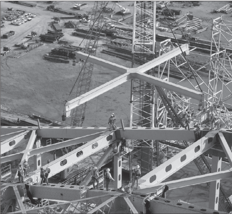
Workers finish steel work on Huey P. Long Bridge widening with the American flag signifying topping off