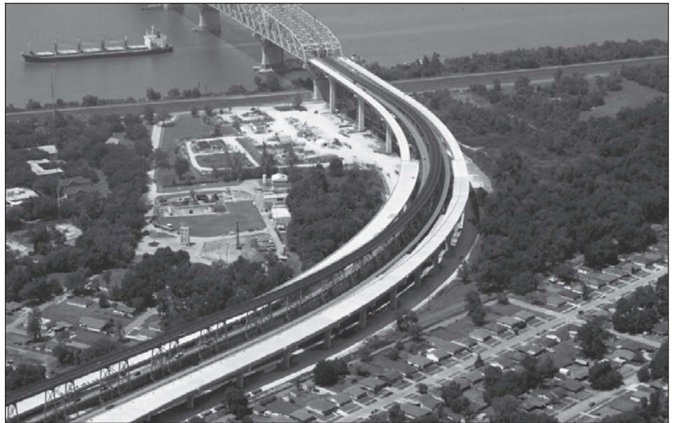
An aerial view of the West Bank approaches and downslopes as the Huey P. Long bridge widening project moves into the homestretch.